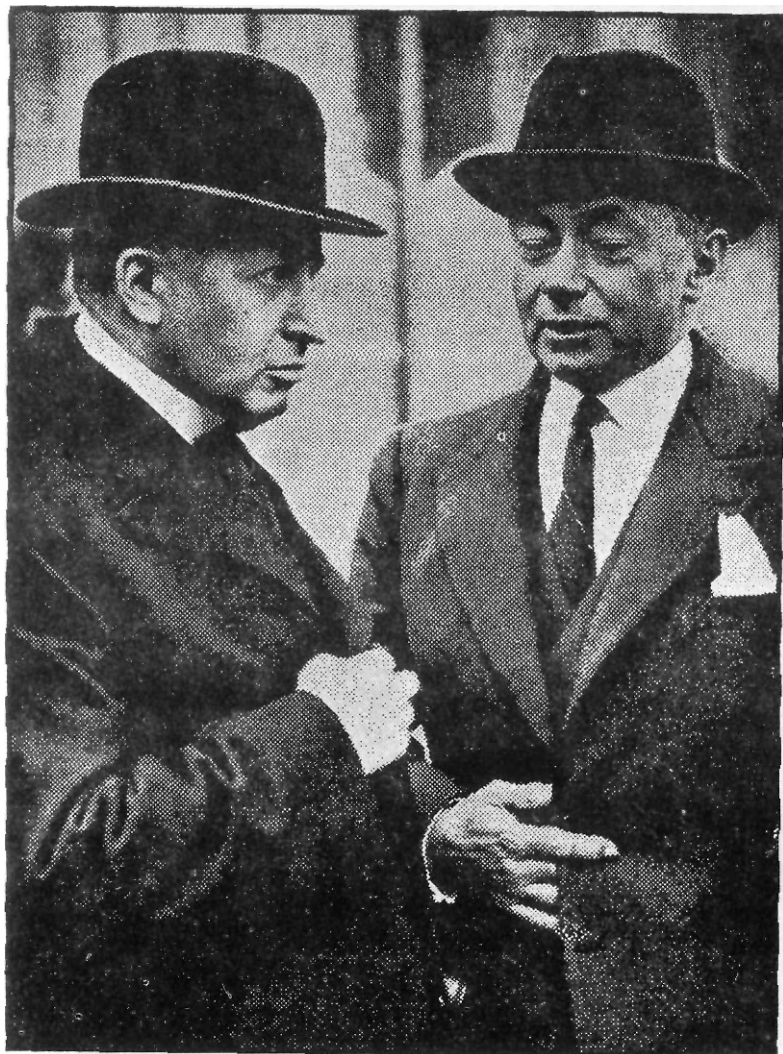
Georges Mandel [Jeroboam Rothschild] and Paul Reynaud.