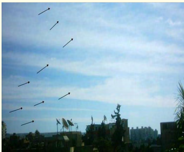
Figure 5: Diffusion of chemtrail stripes to reach each other forming a continuous cloud over thousand of km 2 , Red Sea, Egypt, July 2004.

After a few hours, the sprayed chemtrails begin to disperse to both sides along the lines to form a thin dust long clouds that fuse gradually together (Figure 5), and later on build one giant cloud (Figure 6.) over the whole region extending over many countries reflecting the sun heat and light back into the space resulting a significant rapid decrease in the air temperature, e.g. in Egypt, the temperature decreased from 34 to 14C° at the 1st day 8 hours post application of chemtrails [9].