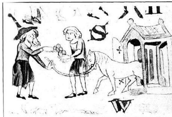
A drawing from the Sachsenspiegel , 1220 A.D., depicts a Jew (left) lending money to a German farmer, while taking his horse as security. Much of Christian property fell into the hands of the Jewish moneylenders when borrowers were unable to pay off the loan along with the usury.

The Jewish Talmud allows the use of usury by recognizing several different modes of obtaining “increase” or interest from money loaned. 10 The Bible however prohibits any and all increase, interest, or gain when there is a loan of “money, food or any thing” (Deut. 23:19; Lev. 25:37). The Jews follow not the Bible but the Talmud as their code to