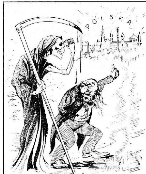
Wzrost okładki do broszury „W szponach komunizmu”.

The events surrounding World War II had registered the largest toll of deaths of white Christian people by the acts and plans of the Edomite Jews. All governments involved in that war were under the financial control of certain Jews