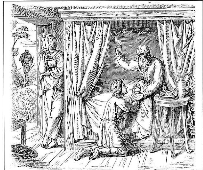
A biblical scene showing Jacob receiving the blessings of the birthright from Isaac while Rebekah watches the approach of Esau.

Throughout history the white European race has easily ruled over all other races and have surpassed them in technology and industry, while none have been able to subdue them. This dominance of the white race over others is an earmark of the blessings of the birthright: