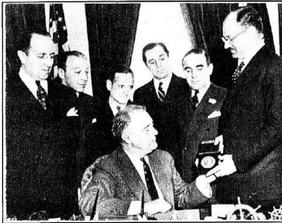
President Franklin D. Roosevelt receives the Zeta Beta Tau fraternity Gottleib medal, from six Edomite Jews, for distinguished service to Jewry, Washington, D.C., May 17, 1937.

Roosevelt had appointed a large number of Jews to government agencies and departments.