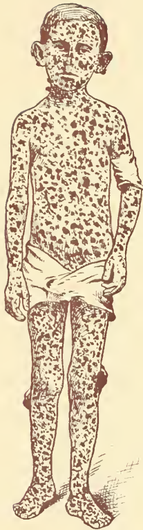
ECZEMA FROM VACCINATION.